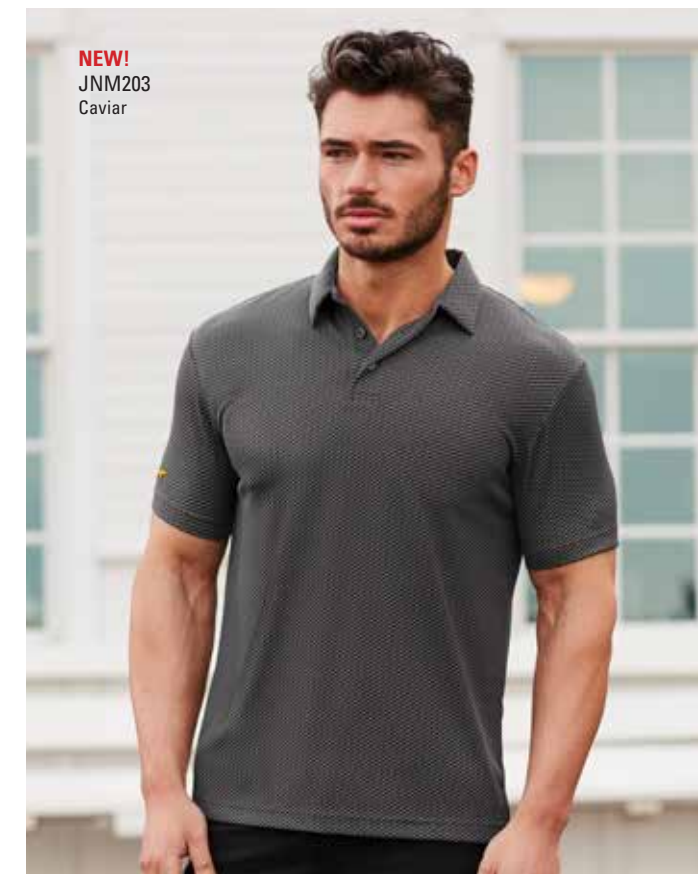
NEW! JNM203 Caviar