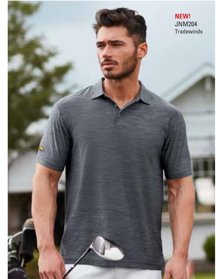
NEW! JNM204 Tradewinds