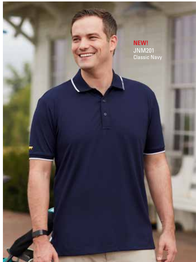
NEW! JNM201 Classic Navy