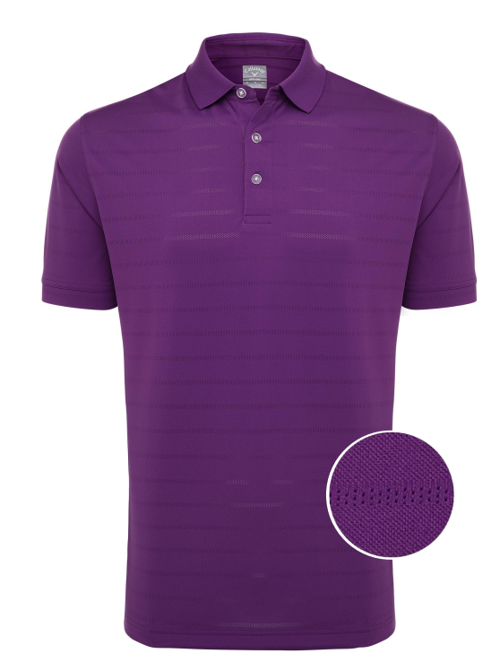
513 Purple Magic